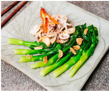
ឆាខាត់ណាគ្រឿងសមុទ្រ KALE SAUTÉ WITH SEAFOOD Stir-fried kale with fresh seafood $8.25