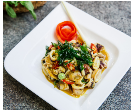
មីកតាក្តៅ SPICY SQUIDS Fried squids with lemongrass, galangal, topped with local herbs $8.25