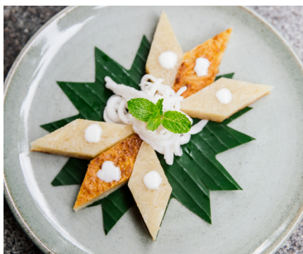
បាក់ប៊ិន BAK BEN Baked tapioca roots $4.25