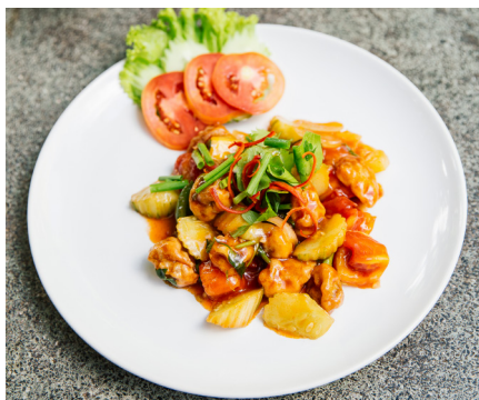
ធាជូអែមតៅហ្វូ SWEET AND SOUR TOFU Deep-fried tofu cooked with sweet and sour sauce, onions, pineapple, cucumbers and tomatoes $7.25