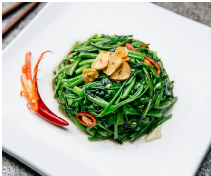
ពាត្រកូនប្រេងខ្យង MORNING GLORY SAUTÉ $5.50