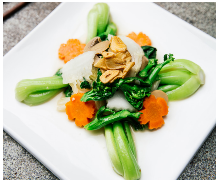
ធាបនៃគ្រប់មុខ MIXED VEGETABLES SAUTÉ Fresh seasonal vegetables $6.25