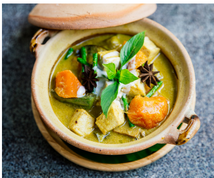
ការឹបនៃ VEGETABLES CURRY Mixed fresh vegetables and hard tofu, cooked in coconut milk and curry spices $7.50