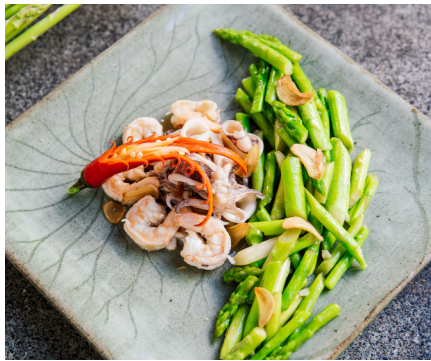
ឆាអាស្កាវ៉ាហ្គីសគ្រឿងសមុទ្រ STIR-FRIED ASPARAGUS WITH SEAFOOD $8.25