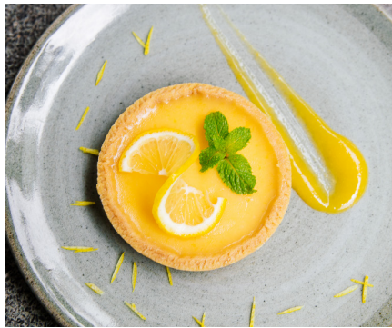
លេមីនតាត LEMON TART $4.75