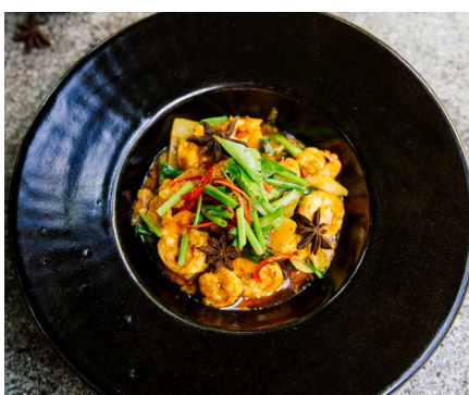
ឆាការីបង្ការ FRIED CURRY WITH SHRIMPS Shrimps fried in coconut milk, cooked with curry spices, onions, lemongrass, kaffir lime leaves, topped with local herbs $8.75