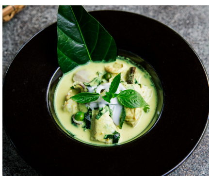
ឆាការីខៀវគ្រឿងសមុទ្រ GREEN CURRY WITH SEAFOOD Seafood, fish, eggplants, pea eggplants, Ngor leaves, kaffir lime leaves cooked with coconut milk, Amok spices and Khmer pounded spices $9.00