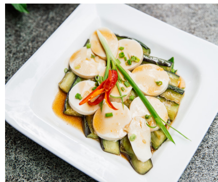
ធាត្រប់តៅហ្វូ EGGPLANTS SAUTÉ WITH TOFU Fried eggplant and soft Tofu $6.50