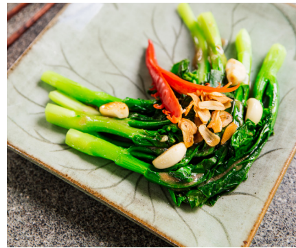
ធាដើមខាត់ណាប្រេងខ្យង KALE SAUTÉ $6.00