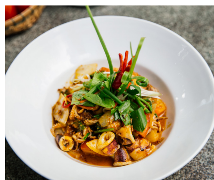
យ៉ាហានគ្រឿងសមុទ្រ SHRIMPS & SQUIDS YAHORN Fried seafood with Yahorn spices, onions, tomatoes, coconut milk, topped with local herbs $8.75