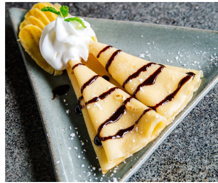
ផែនខេក CREPES Choice of Banana or Chocolate & Mango $4.75