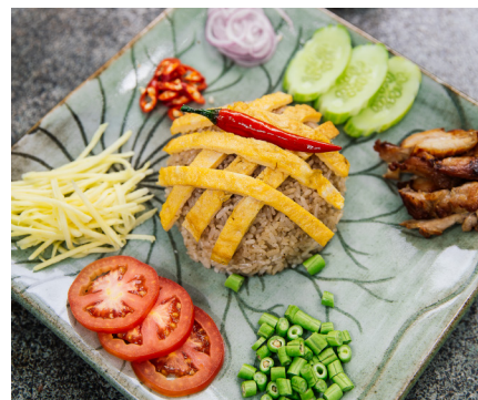
បាយឆាកាពី FRIED RICE KAPIK Fried rice with shrimps paste served with roasted chicken, fried egg, onion, cucumber, tomatoes, green mango, and topped with shallot and roasted chili $8.25

10% Service charge will be added to the end of your bill