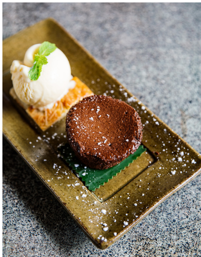
ស៊ុកូឡាហ្វុងដង់ CHOCOLATE FONDANT Chocolate fondant with vanilla ice cream $5.50

10% Service charge will be added to the end of your bill