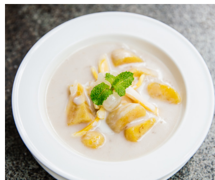
ចេកខ្លឹះ BANANA IN COCONUT MILK $4.50