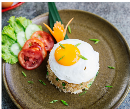
បាយឆា FRIED RICE Choice of seafood or beef, chicken, pork fried with steam rice, served with fresh vegetables and fired egg on top $7.00