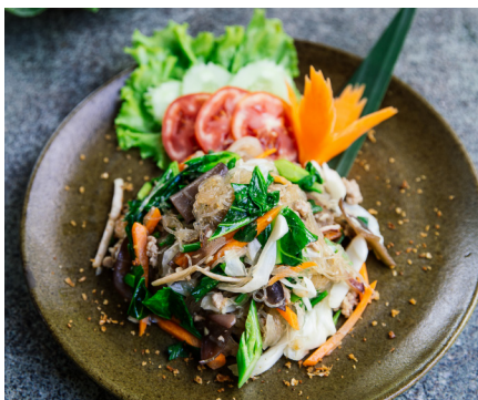
ឆាមីស្ត FRIED GLASS NOODLES Fried glass noodles with minced pork, black mushroom, dry squids and shrimps served with fresh vegetables $7.00