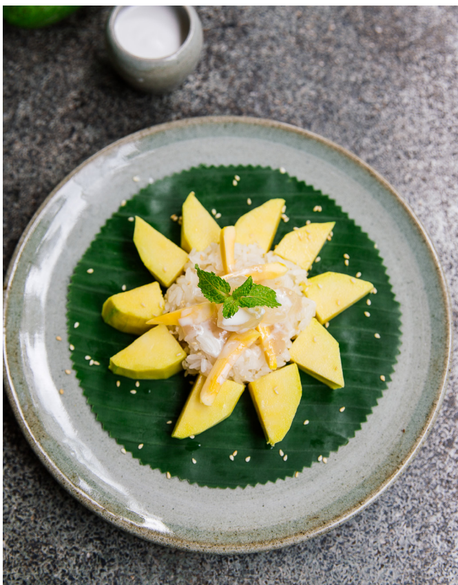
បាយដំណើបស្វាយ MANGO STICKY RICE $4.75