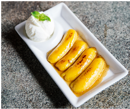
ចេកចៀនដុតជាមួយស្រា BANANAS FLAMED IN RUM With coconut ice cream $5.50